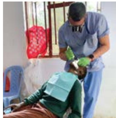
International Medical Relief, Africa 2021