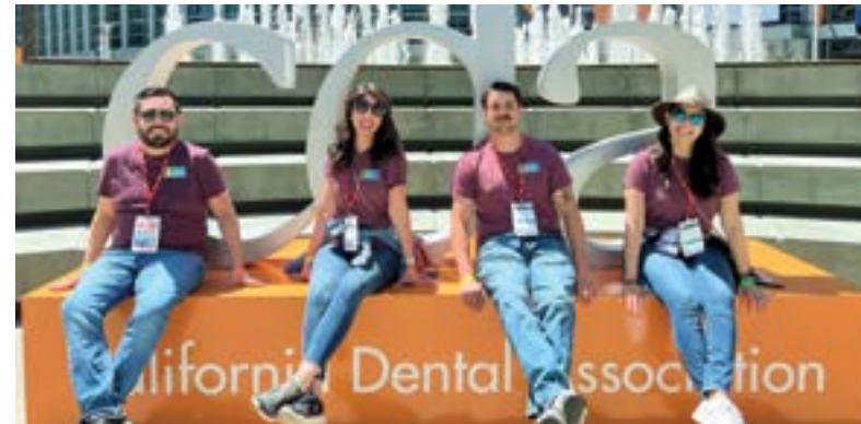
CDA - Team Continuing Education. 2022